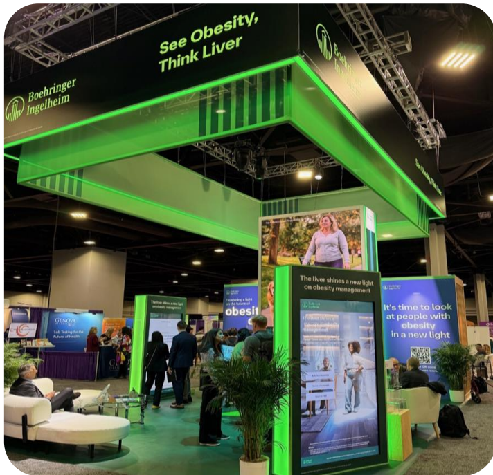
Boehringer Ingelheim at ObesityWeek 2025